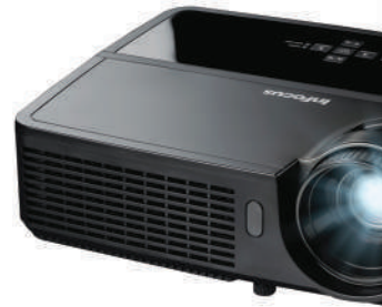
Smartboards, Doc-cams, Projectors