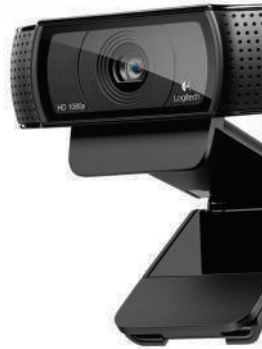
Video Cameras & Mics